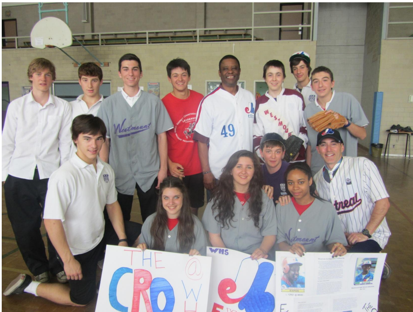
Former Montreal Expos star Warren Cromartie visited Westmount High School in May.